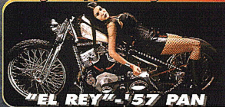
"EL REY" - '57 PAN

CHOPPED SHOVELS, PANS, TRIUMPHS AND A RIGID SUZI TOO!